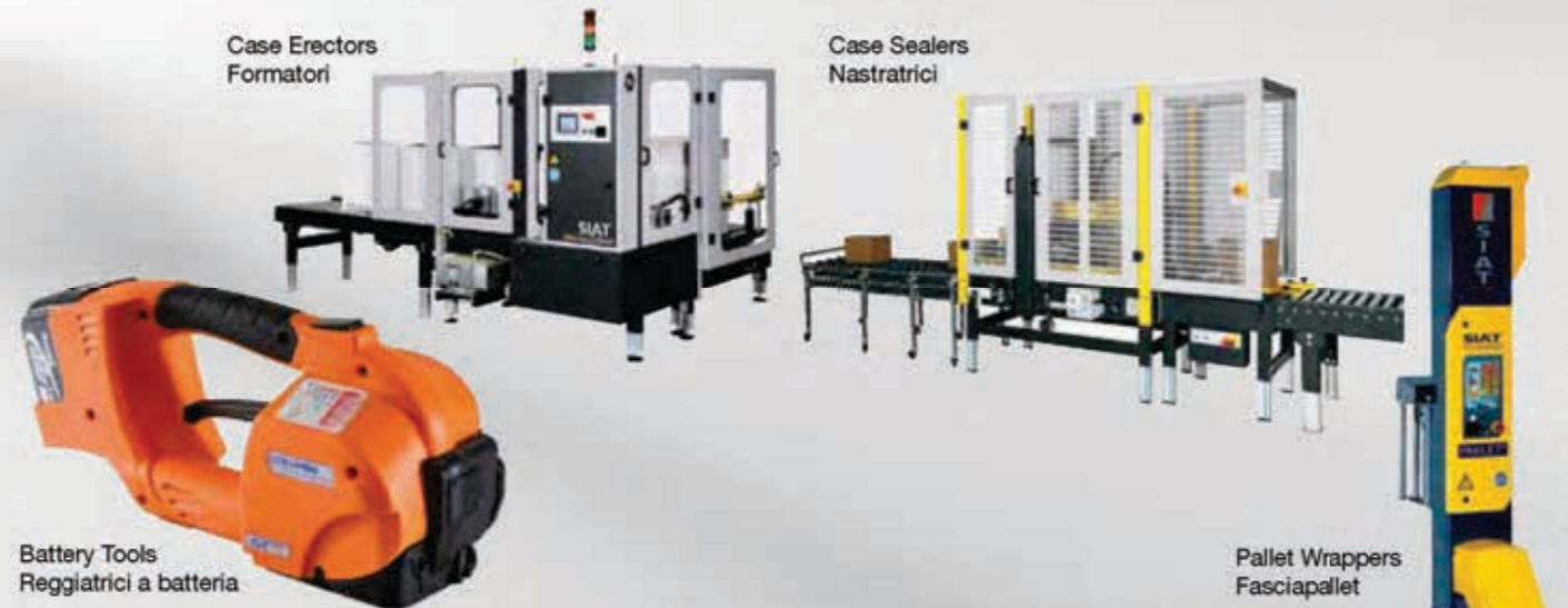
Battery Tools Reggiatrici a batteria

N/A = Non applicabile | Not applicable | Pas applicable | Unanwendbar | No aplicable